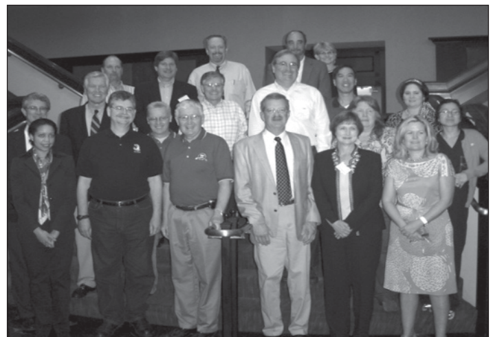
District XI officers and section officers at the first District XI Advisory Council meeting on March 25 in Fort Worth